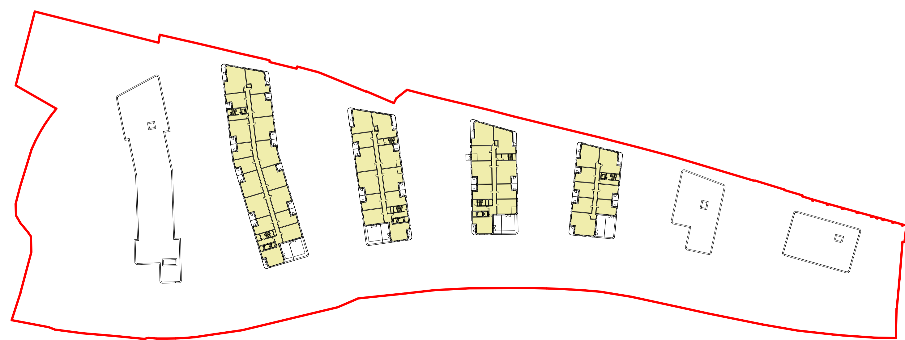
1 06 - SIXTH FLOOR 1:1000